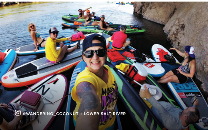
@WANDERING_COCONUT • LOWER SALT RIVER

Even though Mesa is in the heart of a desert, visitors can take advantage of the city's close proximity to a water recreation paradise. There are four lakes and two rivers that offer Mesa visitors easy access to desert boating, fishing, rafting, kayaking, water skiing, wake boarding and jet skiing. Or, partake in the ever-popular activity of "tubing", a leisurely float along the cool waters of the Salt River via inner-tube!