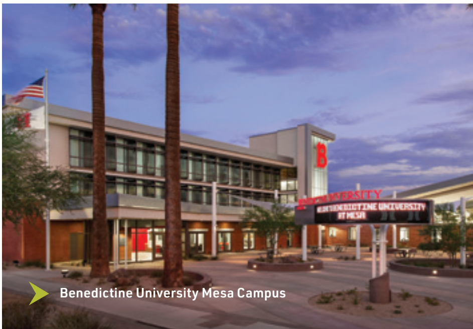
▶ Benedictine University Mesa Campus

Benedictine University at Mesa offers 28 different majors and minors, including Accounting, Communication Arts, Computer Science, Criminal