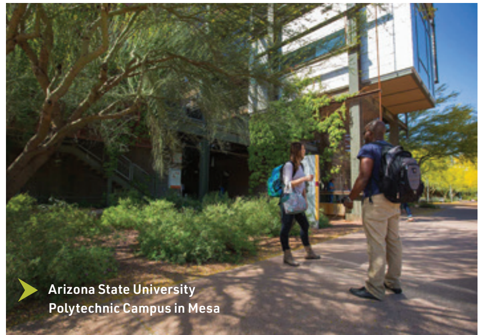
► Arizona State University Polytechnic Campus in Mesa

Within the southern portion of the Polytechnic campus is the 300-acre ASU Polytechnic Innovation Zone, which specializes in hands-on exploration of innovative solutions in aviation, renewable energy, human-technology integration, comprehensive commercial printing and design services, and on-demand digital manufacturing, as well as developing solutions for better health outcomes. economicdevelopment.asu.edu/innovation-zone/asu-polytechnic-innovation-zone/