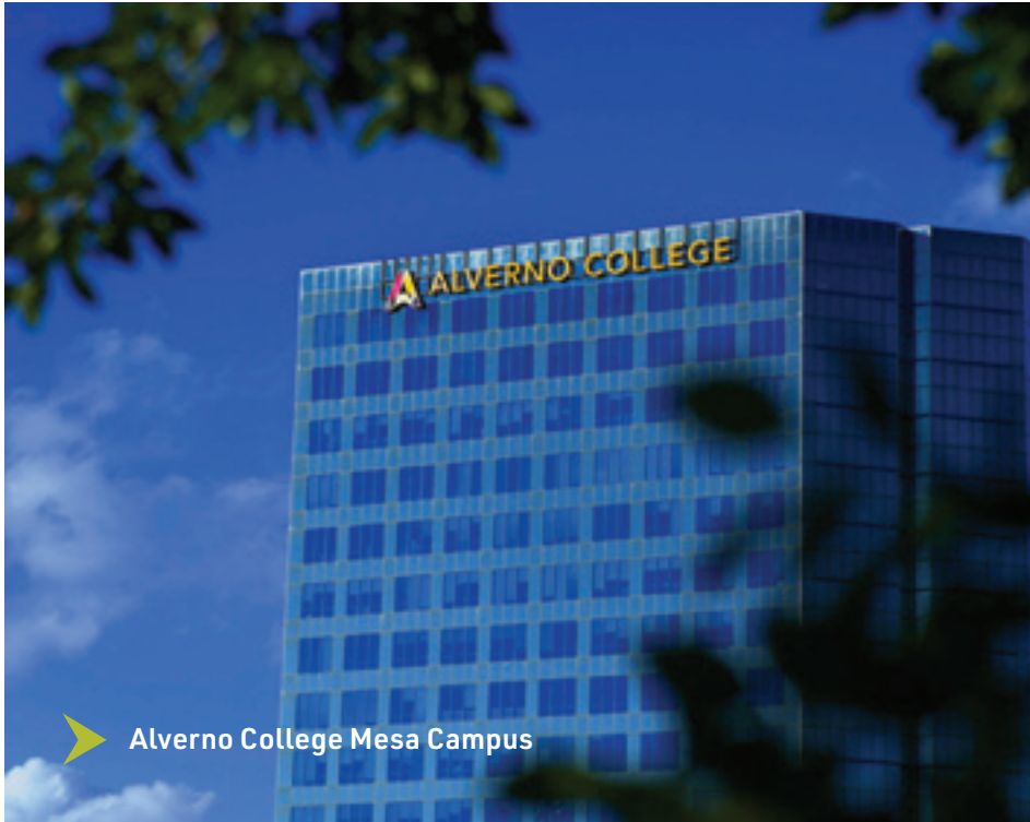
▶ Alverno College Mesa Campus