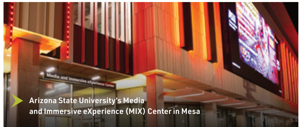
➤ Arizona State University's Media and Immersive eXperience (MIX) Center in Mesa