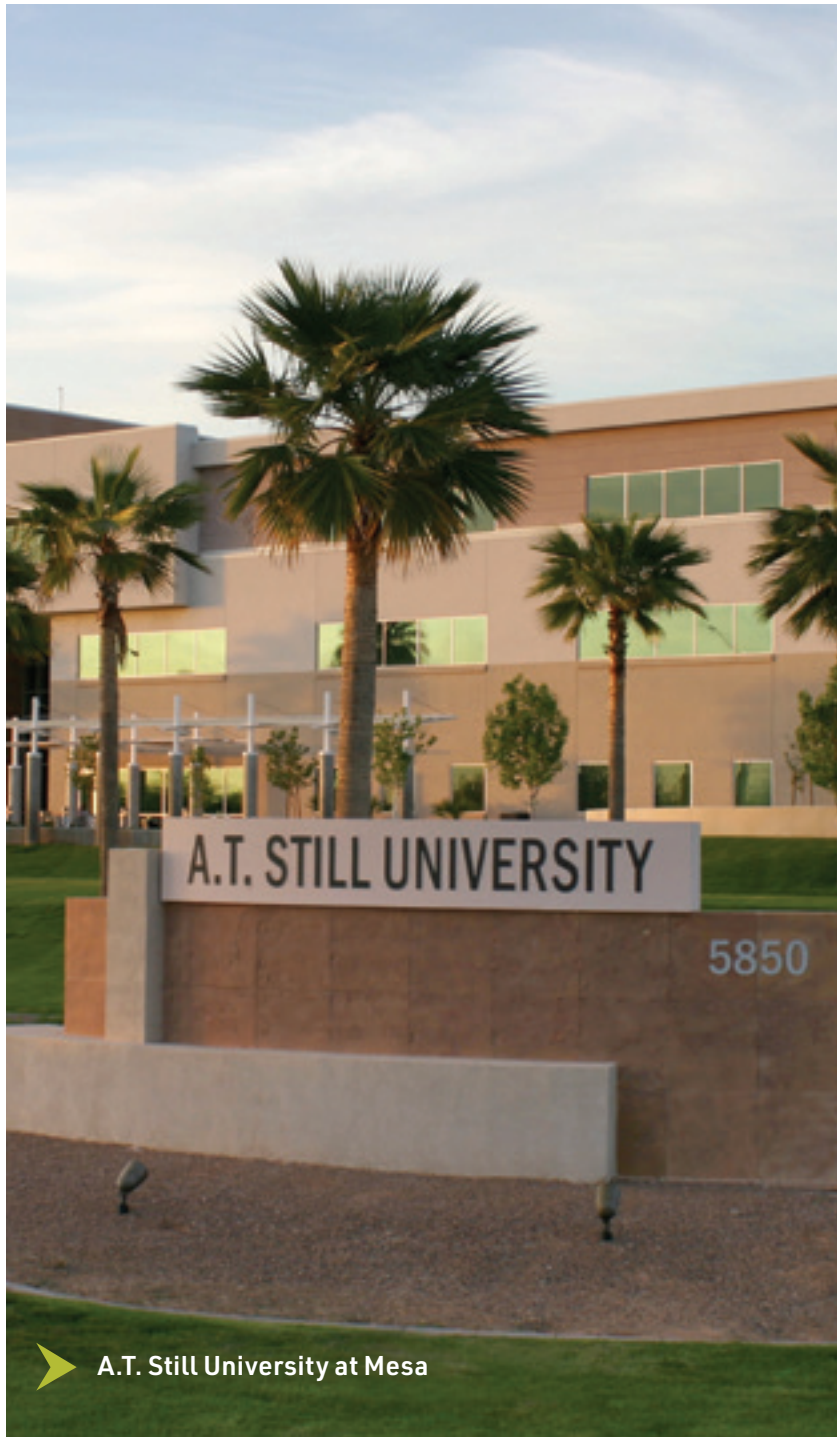
➤ A.T. Still University at Mesa

Additionally, Mesa's Office of Economic Development has produced a workforce development strategy outlining how the City along with its partners, can provide resources to meet the needs of residents and the business community.