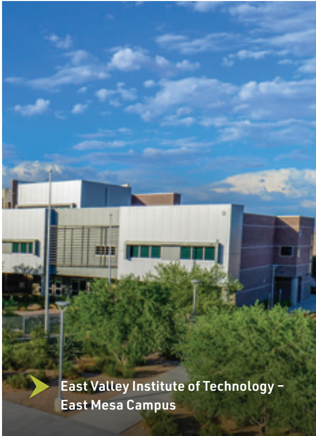
East Valley Institute of Technology - East Mesa Campus