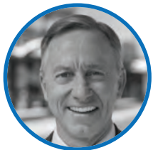
JOHN GILES MAYOR, CITY OF MESA