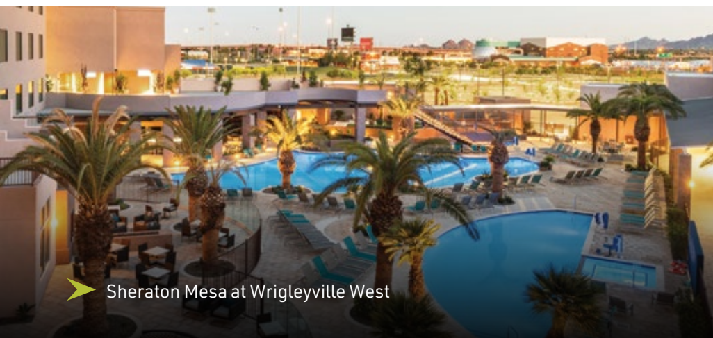
➤ Sheraton Mesa at Wrigleyville West