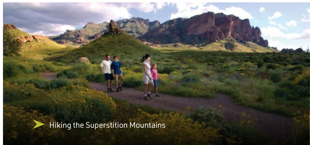
➤ Hiking the Superstition Mountains